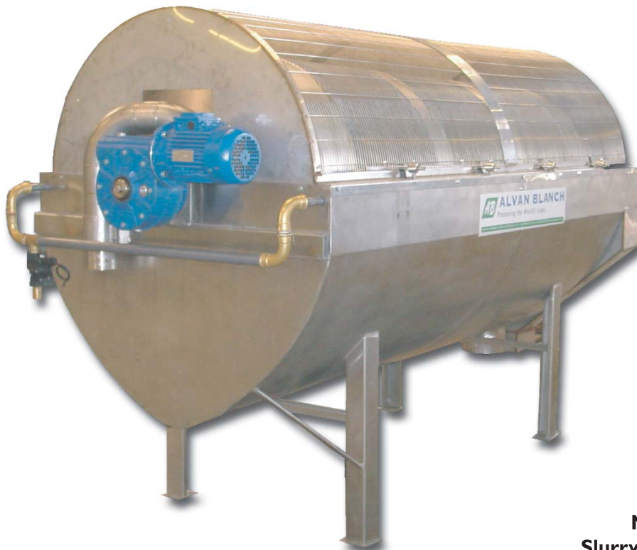
Model 2200 Slurry Separator