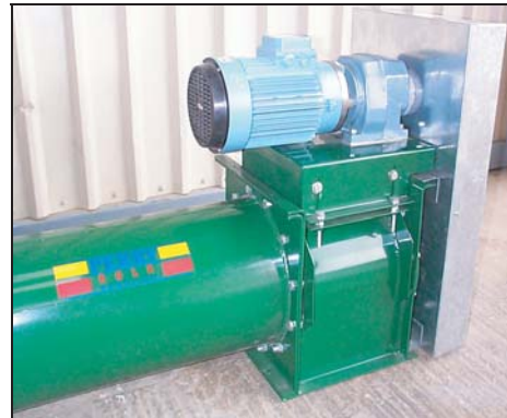
Drive section of 315mm conveyor.