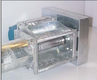
Flanged inlet on 160mm conveyor, note heavy duty flight