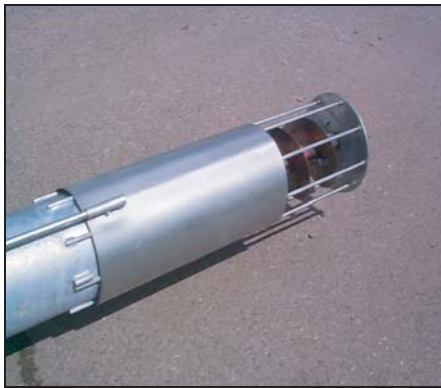
Inlet section with exposed flight and control sleeve.