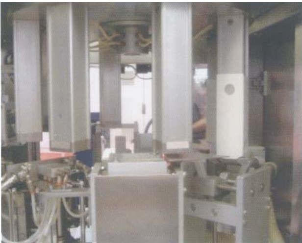
AB Paper carton form system