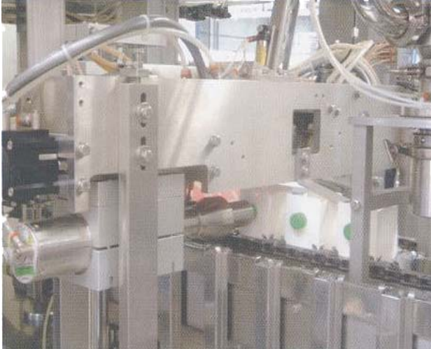
AB Ultrasonic cap welding system