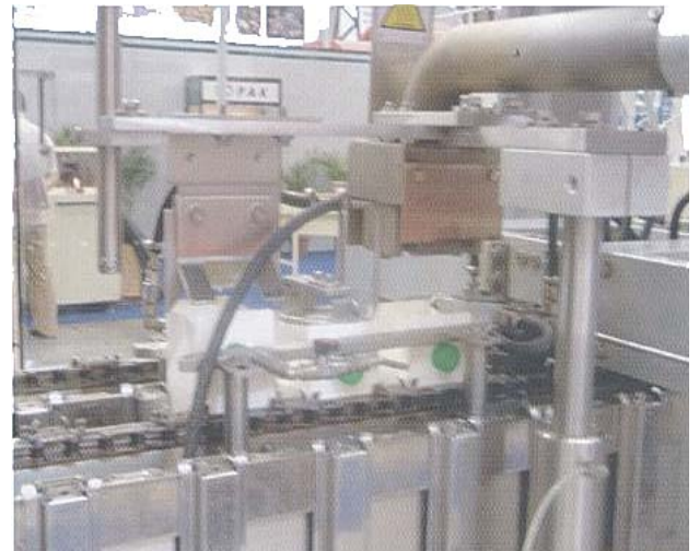
AB Top sealing