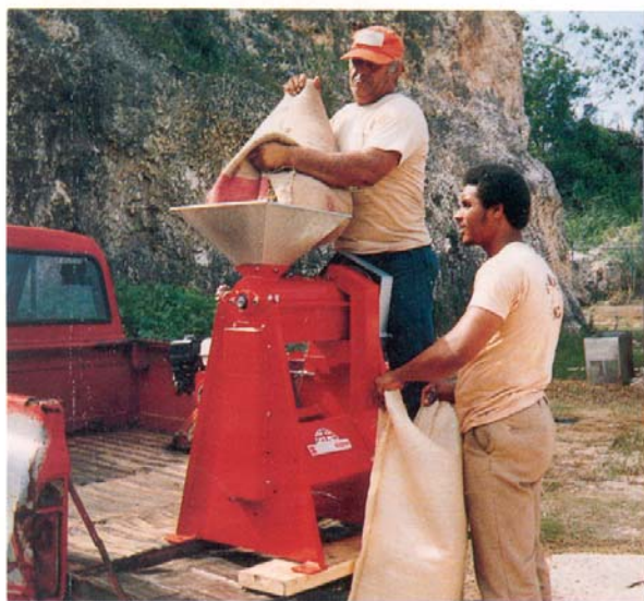
AH-4 Huller petrol model (transportable)