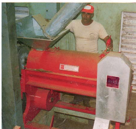
AH-0 Huller with electric drive