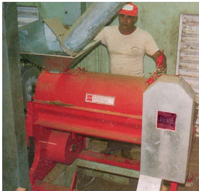
AH-0 Huller with electric drive