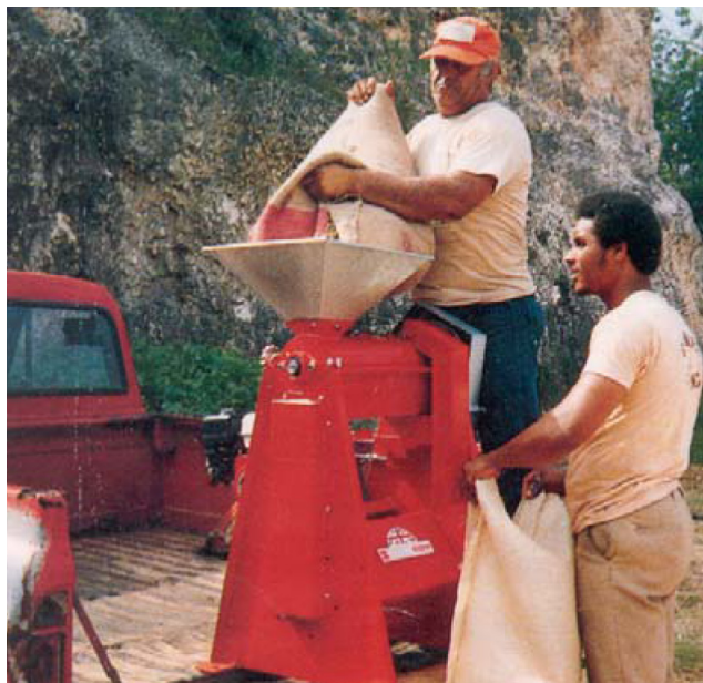
AH-4 Huller petrol model (transportable)

The complete range of machines is also suitable for maize.