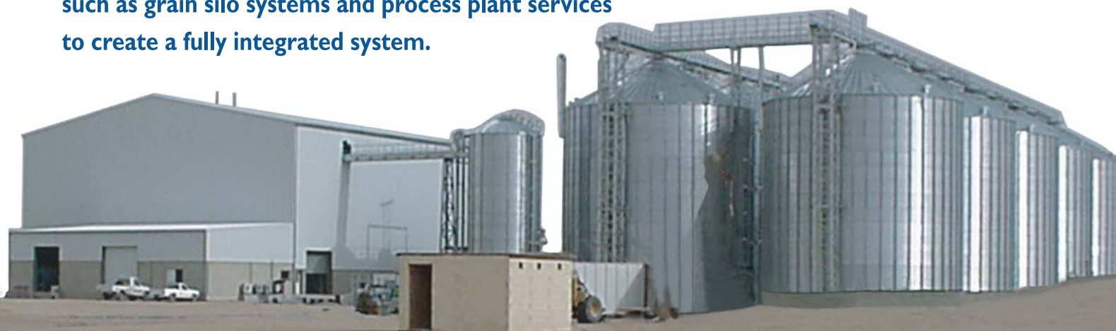
20 tonne/hour Maize Flaking Plant with 30,000 tonne storage

We also offer a comprehensive range of associated facilities such as grain silo systems and process plant services to create a fully integrated system.