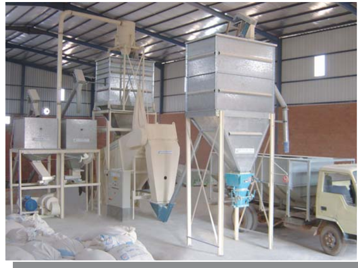
5 tonne/hour Poultry Feed Mill

All products are manufactured to the highest standards for efficiency of operation, durability and long operating life.