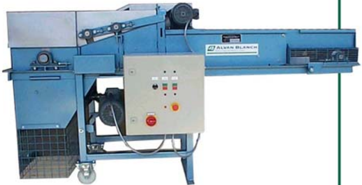
Model: D400 Plant Chopper