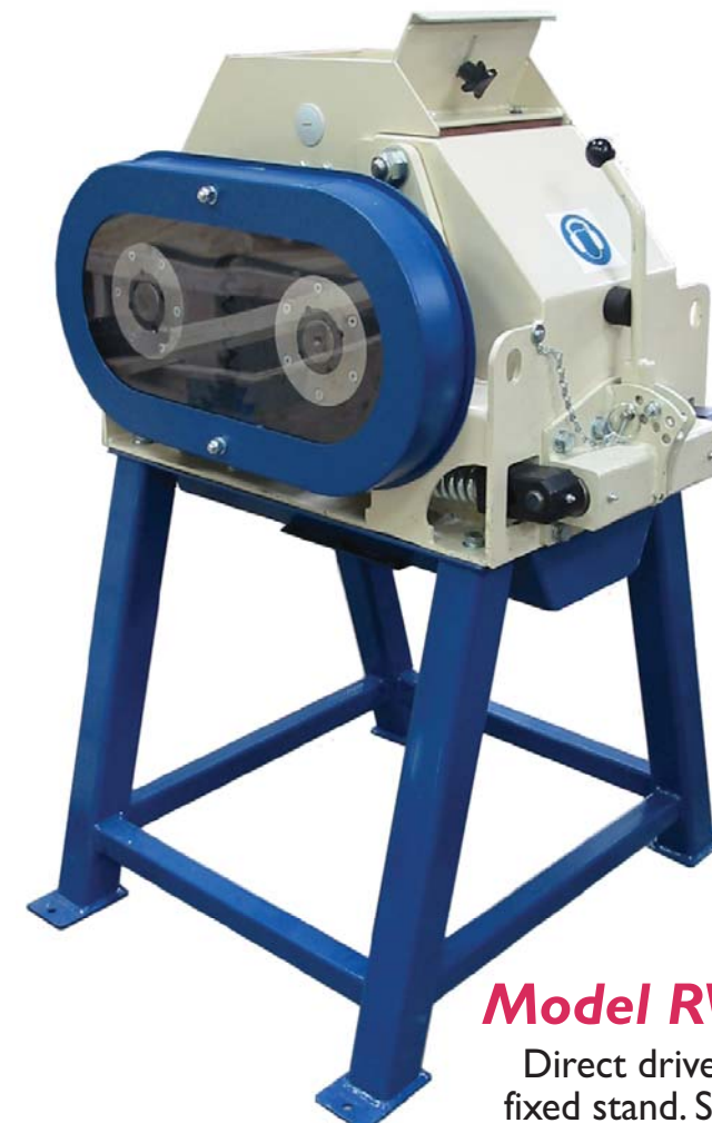
Model RV280 - T

The units can be supplied independently - on a fixed frame as a totally portable package - also with an Alvan Blanch Mixer to form a complete Mill/Mix unit.