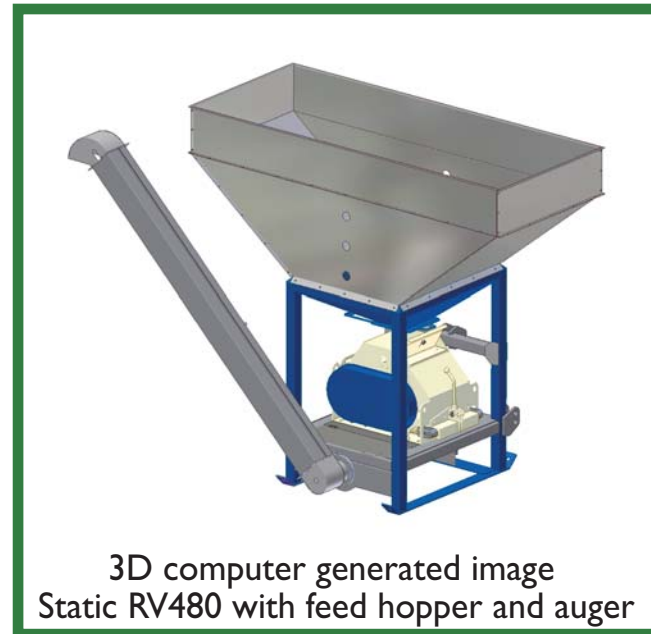
3D computer generated image Static RV480 with feed hopper and auger

APPLICATION: Alvan Blanch RV range roller mills are suitable for cereal crops and, with rapid adjustment of roller setting, can produce material at any degree of crush from bruised oats for horses to flat rolled or lightly cracked barley for cattle rations.