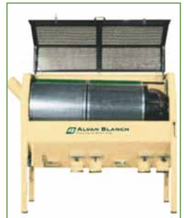
Model shown: RCG