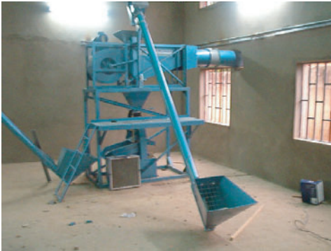
Intake, precleaning and destoning