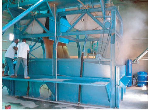
Parboiling system and drying process