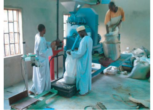
Milling, polishing and packaging