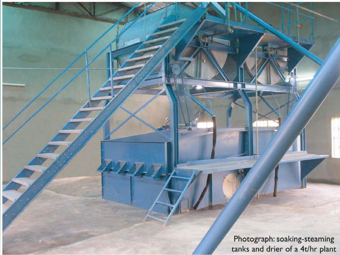
Photograph: soaking-steaming tanks and drier of a 4t/hr plant