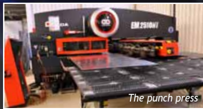
The punch press

Over the past 18 months Alvan Blanch have installed new automated CNC production facilities in a radical overhaul of its sheet metal processing line. A latest generation laser with quick-change bed for 4m long sheets cuts steel plate of up to 20mm with absolute precision. Two new brake presses provide improved