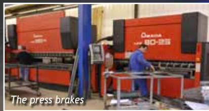
The press brakes