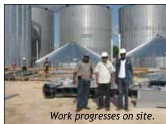
Work progresses on site.

supervising installation of both plants. ■