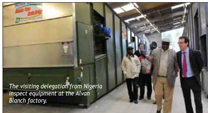
The visiting delegation from Nigeria inspect equipment at the Alvan Blanch factory.

Alvan Blanch celebrated winning a major contract in Nigeria in 2010, in the face of stiff worldwide competition, to supply and install two complete grain drying, cleaning and storage plants, each of 25,000 tonnes capacity.