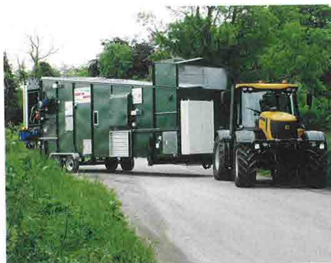
It may look big, but Alvan Blanch's new drier is no bigger than a combine.

agricultural engineering specialist APECS that suggested the modifications necessary to transform the basic drier into something truly mobile.