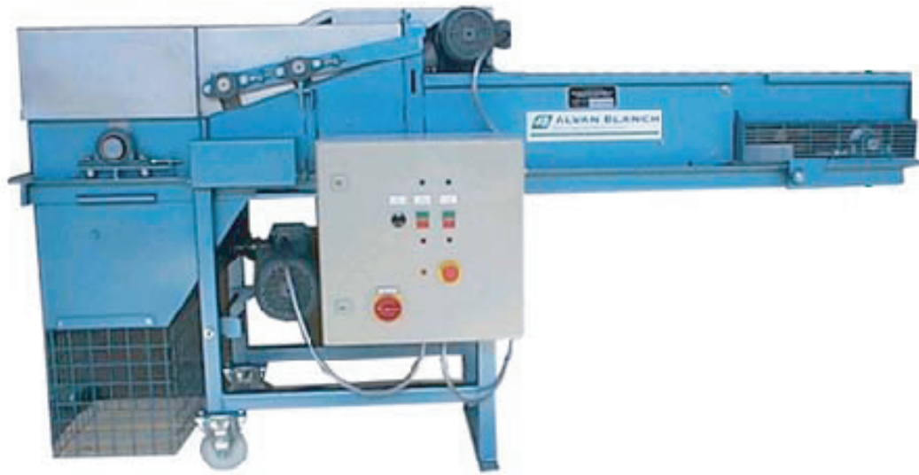
Model Number: D500 Plant Chopper