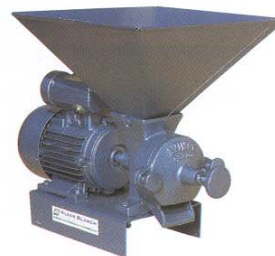
Mini E Grinding Mill

In accordance with our policy of continuous development, we reserve the right to change specifications and prices at any time without notice or incurring liability to purchasers. All goods supplied according to our published terms and conditions of sale (copies on application)