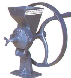
Mini H Grinding Mill

AB ALVAN BLANCH Processing the World's Crops